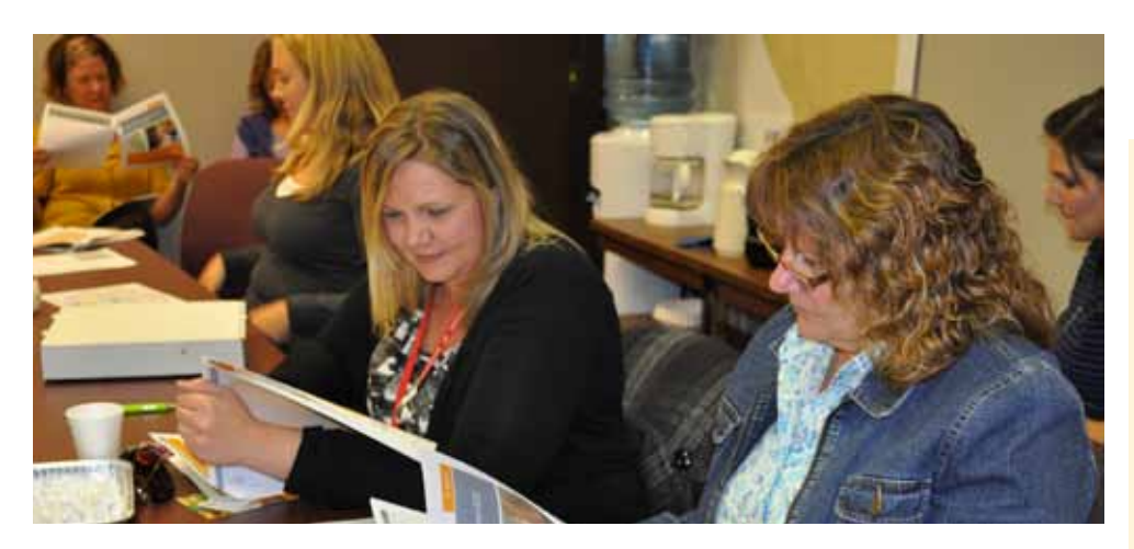
Members of the Hanna ECD Community coalition check their first community results in October.

What next? We expect to have the first waves of EDI analysis completed for all but a few communities in early 2012. CIPs will be developed for all communities that are ready to receive them during the upcoming year. We will also launch our new website, which will include maps and information on the progress of preschool children in Alberta. Our website will keep Albertans informed about the wonderful activities that communities are implementing to support their young children and families.