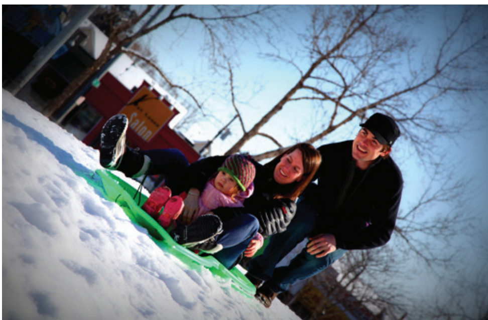
The slow movement encourages parents to micromanage less and enjoy their children more.

“It takes time to slow down,” said the self-described reformed speedaholic, who has discovered that “ Snow White is really better with seven dwarves.”