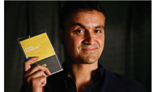
Writer and journalist Carl Honore champions slow parenting.

Children are overscheduled, rushed and hyper-managed, with little time for the unstructured play that they need to think creatively, socialize and develop properly, Honore said. Neuroscience has shown that the most rapid brain development occurs during the early years, but this has been widely misinterpreted to mean that the more stimulation a child gets and the earlier, the