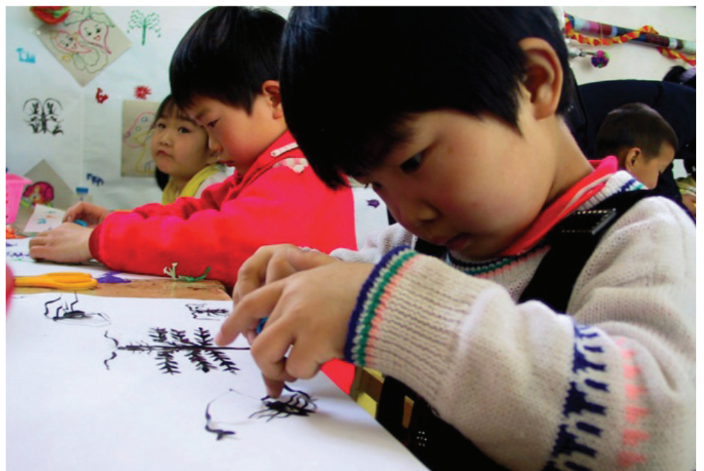
Young children in a preschool in rural China create intricate paper cutting art, exhibiting scissor skills far beyond what would be seen in children at that age in North America