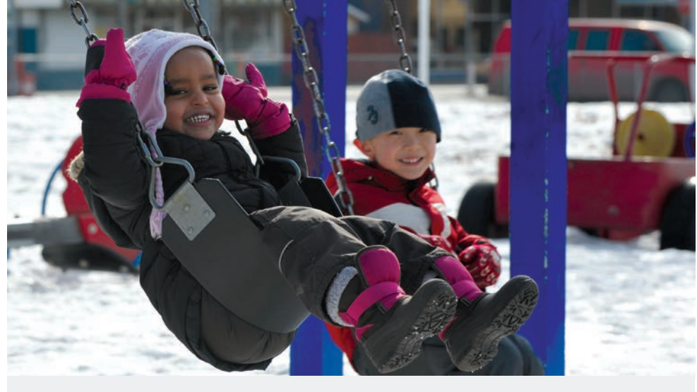
Outdoor play is critical to children's early development and long-term physical and mental health.

Canada was slow to adopt national guidelines for physical activity for young children,